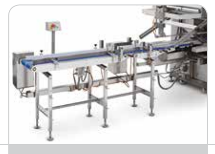
Automatic feeding conveyor