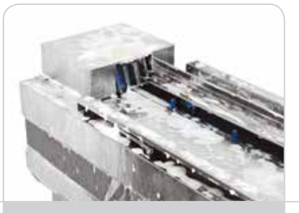
Infeed conveyor designed for easy cleaning