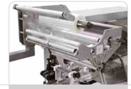
Pneumatic fastening reel holder and motorized film unwind