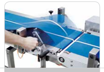
Easy feeding belt removing for cleaning