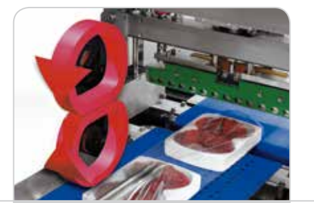
"Long Dwell" sealing head able to pack at highspeeds